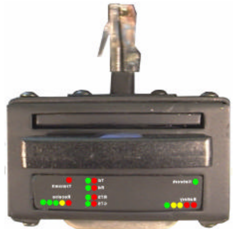
End View, Actual Size